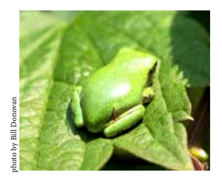
Perfectly hidden, Neon-green on a maple leaf, But called GRAY treefrog?