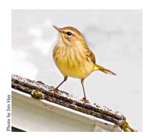
Early autumn warm-up, Warblers flitting around rooftops Watch out cluster flies!